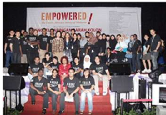
Featured in News

Two counsellors are assigned to patients whose results are positive for hidden blood in the stool. For patients confirmed with cancer, a second meeting will be set up to discuss options moving forward for medical and financial support for treatment.