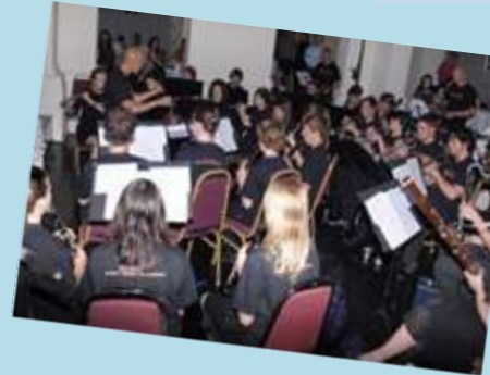
Left: King's School Ely Concert Band entertained guests with a wide repertoire of music that created a fun and memorable evening.