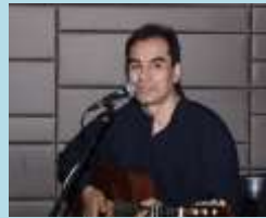
Below: Erik Estrada graced the floor with Latin music.

All cash donations are issued with tax-exempt receipts.