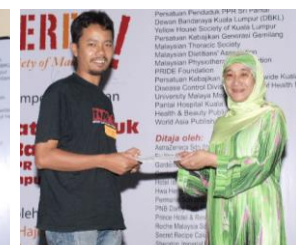
Lucky winners of the health quiz receiving their prizes.