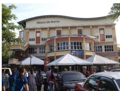
The venue at Medan Sri Pantai, Pantai Dalam, Kuala Lumpur

EMPOWERED! The Cancer Advocacy Society of Malaysia, in collaboration with the Social Welfare Department of Malaysia and numerous other like-minded organizations held a cancer awareness programme on 21 November 2010 for over 350 low-income residents of PPR Sri Pantai, Pantai Dalam and Sentul.