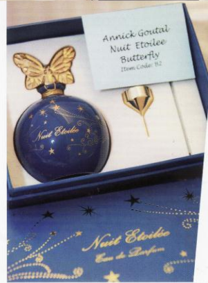
Annick Goutal Nuit Etoilee Butterfly 100ml Eau de Parfum

THE ELEGANCE CLUB IN KUALA LUMPUR HAD the honour to host a special charity dinner, 'Be an Angel with Tan Sri Michelle Yeoh' organised by EMPOWERED , a non-profit organisation committed to saving lives, preventing cancer and eliminating suffering amongst the poor in Malaysia. Framed with elegant jazz music, this event presented a unique showcase by Runway Inc, where angel-models encouraged guests to buy the items displayed for charity purpose. Between a tasty dinner and a vivid sale, this event ended with the happy knowledge that the celebrations will help underprivileged Malaysians through Empowered's projects.